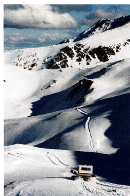
ANNA SEGAL, LETTING THEM RUN IN THE ALPINE WILDERNESS. (RUNDLE) INSET: PRETTY COOL, HAVING YOUR OWN CAT TO ACCESS YOUR OWN PRIVATE TERRAIN. (RUNDLE)