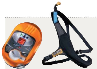
Gear on assignment

The 40 odd folk on the mountain lodge deck at lunchtime are constantly entertained by us virgins negotiating the towropes, dropping off like flies till we get it right. The boys and I follow Heather across Hamilton Face, traversing its wide-