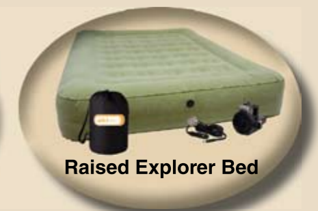
Raised Explorer Bed