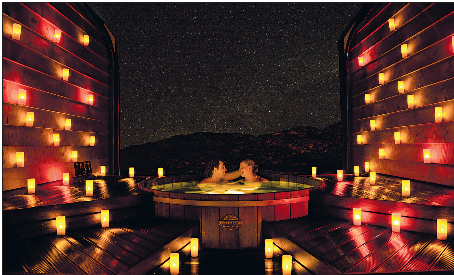
Cool solutions ... (clockwise from above) Onsen Hot Pools, Queenstown; Endota Spa, Falls Creek; hot stone therapy, Onsen Spa Retreat, Dinner Plain.

These purpose-built, onsen-style hot pools are perched on a cliff overlooking Queenstown's Shotover River canyon. Each pool is housed in a private, cedar-lined bathing room built with a retractable picture window, so you can bathe outside if you wish. Up to four adults at a time can soak in the tub. The temperature is adjustable for those who can't stand the heat. The water may not be volcanic or thermal but it is a mix of