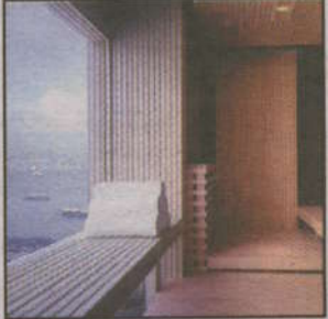
relax, flow, detox or tonic-oil preparations; 90 minutes, $130. Midweek, three-hour programs from $265 for use of a Plateau Room.

TREATMENTS: Signature Plateau Massage, combination of shiatsu, Thai and Swedish in