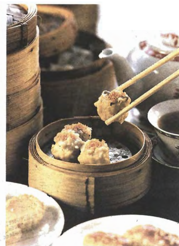
Enticing: Dim sum treat, above and Hong Kong skyline seen from the Peak; opposite, Cheung Chau island and limos at The Peninsula