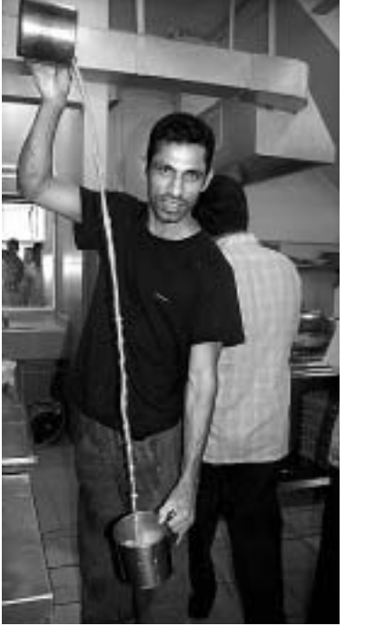
Long drink: tea cures all ills.