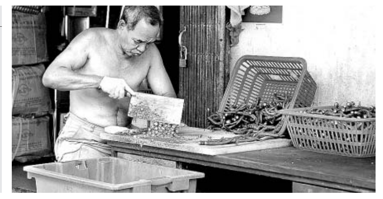
Get in for your chop: most Singaporeans are Chinese, so Chinese food is in demand and vendors do a roaring trade.

Now that's the kind of bargain I came here for.