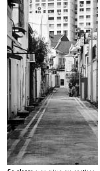
So clean: even alleys are spotless.