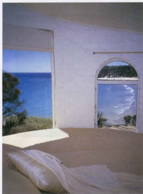
ROOM WITH A VIEW The tower bedroom at the Cliff House overlooks the western end of Snelling Beach.

Sky House is a kilometer up the hill, a perch that affords sweeping vistas. A romantic, Tuscan-style deck makes the most of the views, and is adorned with sundials should you wish to keep track of